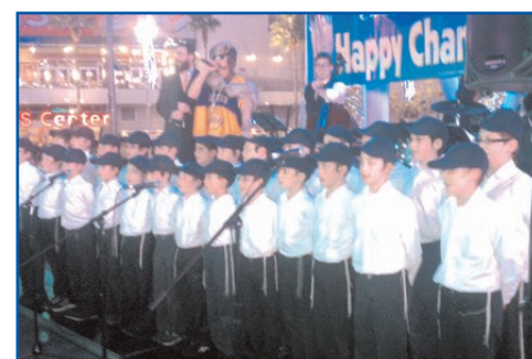
Cheder Boys Choir performing at "LA Live" on the last night of Chanukah.