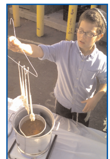
Chayolei Tzivos Hashem candle making workshop in honor of Chanuka