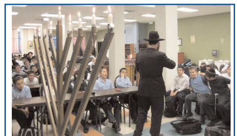
Cheder candelighting ceremony on the last night of Chanuka at Cheder Menachem.